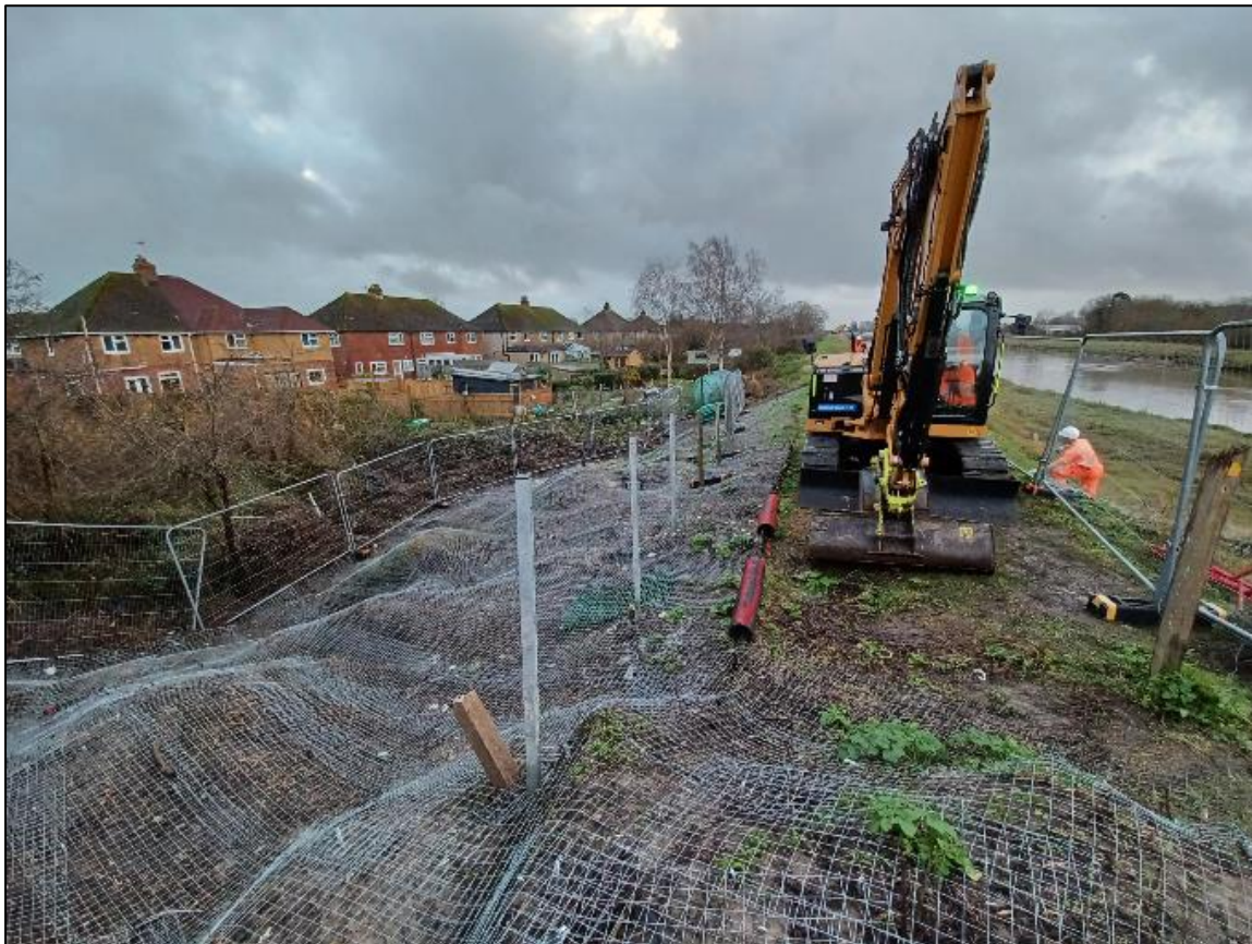
[Kings Avenue, Rye]

Prior to the start of works, we intend to finalise our proposals with relevant authorities to create an access area into section 4 from New Road adjacent to the Monk Bretton Bridge. We will also be completing our preparations for the piling works, which will commence in April 2024.