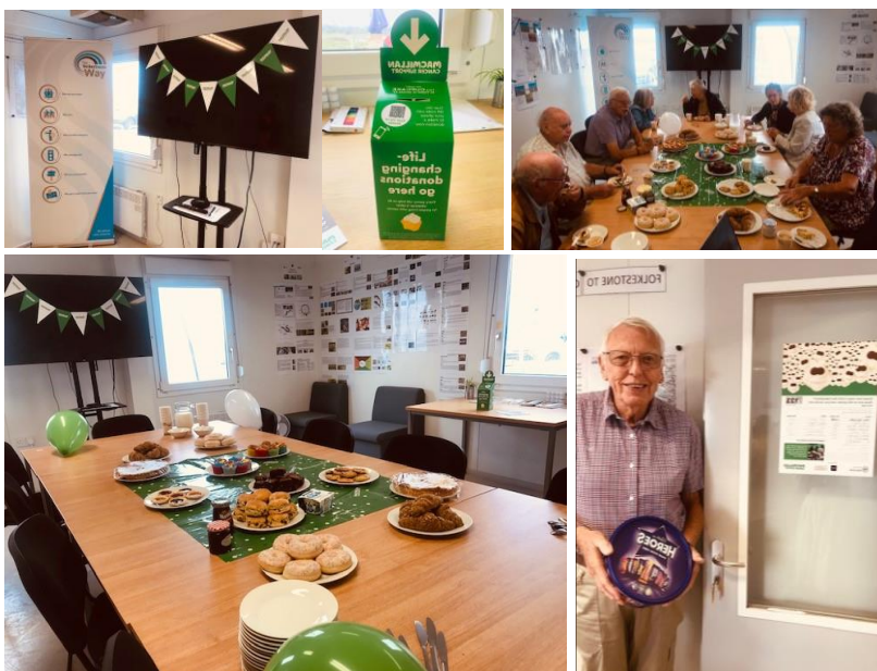
[McMillan Coffee Morning]

We hosted a Macmillan Coffee Morning at our Customer Visitor Centre, which was a huge success and have raised £153.40 for a great cause!